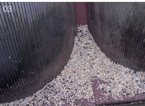
IMAGE 03_ Before IMAGE 04_ After

Our field service team removed all damaged scallops and installed new Johnson Screens Vee-Wire scallops