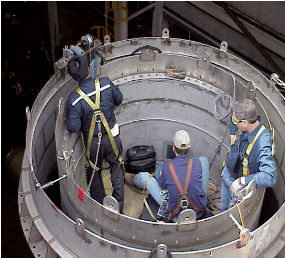
Ultrasonic device allows quick on-site inspection of the annulus between inner and outer screens.