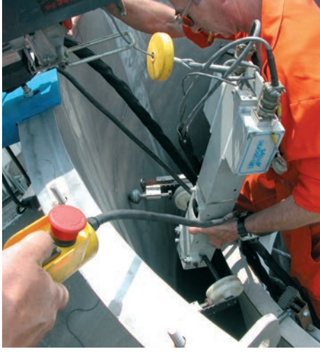
Ultrasonic device allows on-site inspection of annulus between inner and outer screens.