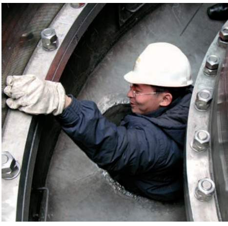
Our engineering staff are available for technical consultation at any point in the process from product design to fabrication to installation and start-up.