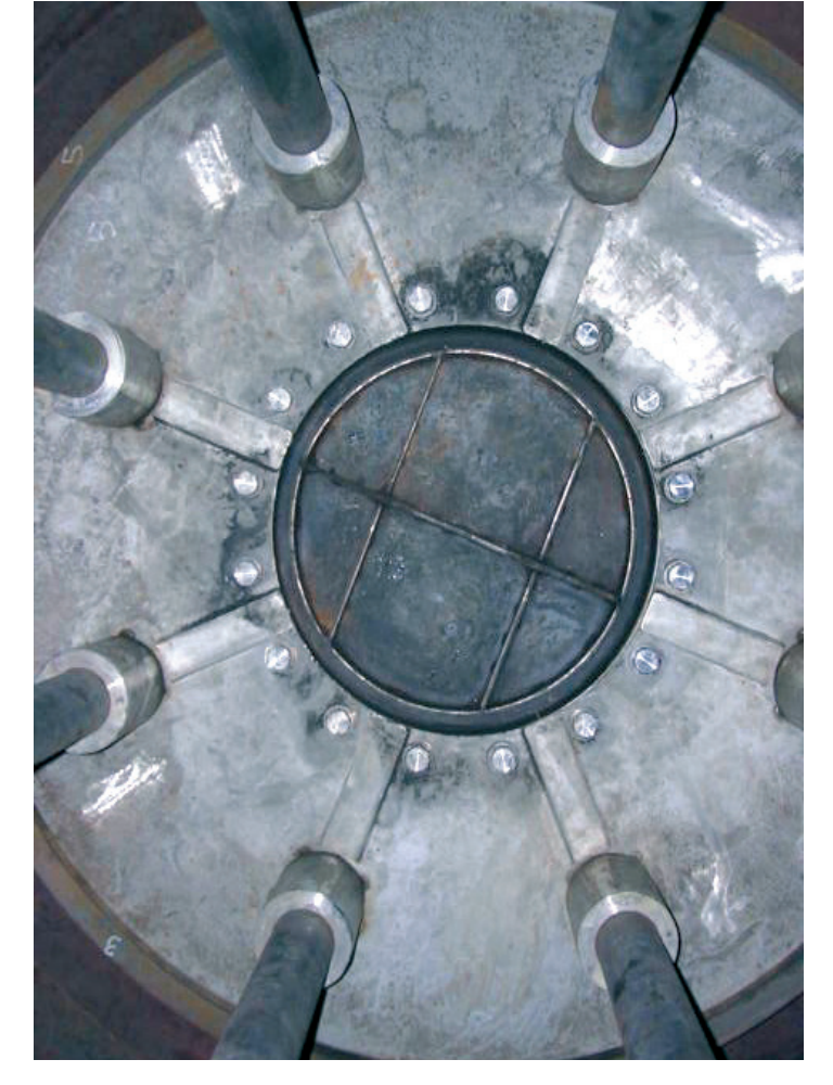
Many coverplate designs are available. This segmented coverplate is designed to accommodate catalyst transfer pipes.

Field service is readily available from experienced crews. This can include on-site technical supervision, analysis of product condition, labor during installation/ repair or engineering consultation on difficult process issues.