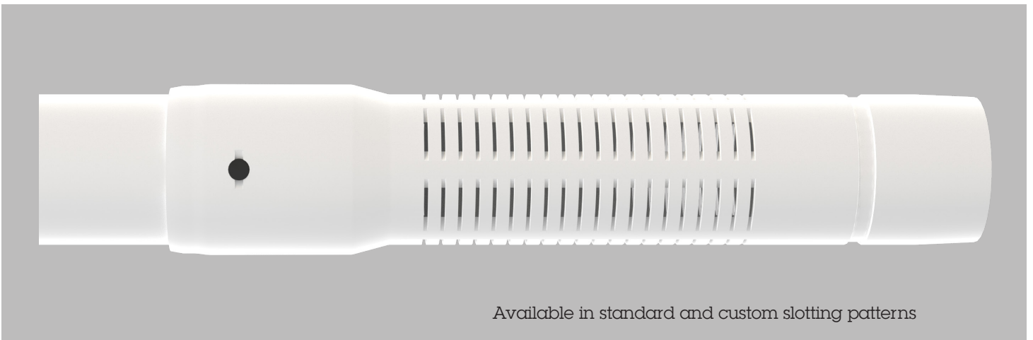
Available in standard and custom slotting patterns