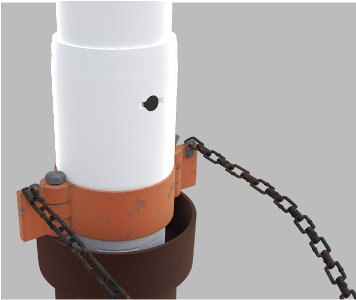
Standard bell end allows for traditional elevators to be used