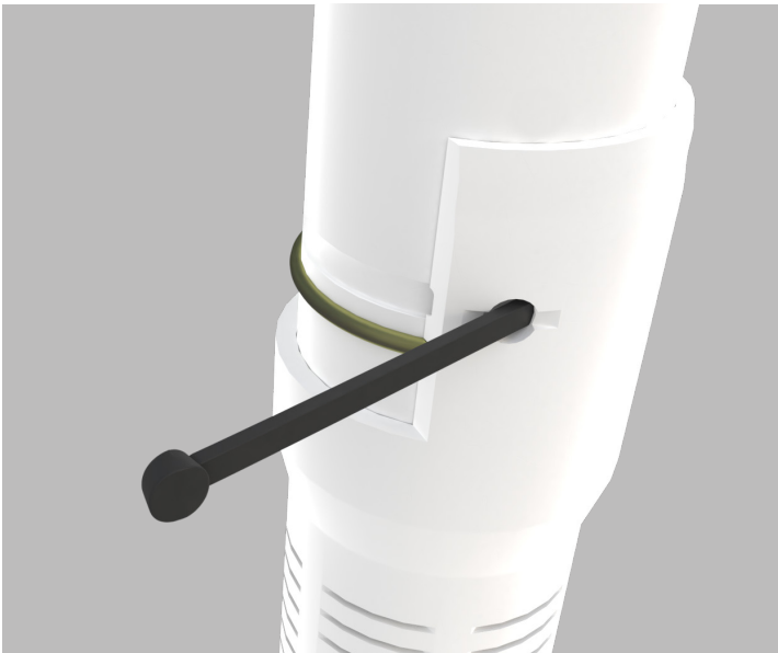
Button Spline design allows for easy insertion and is recessed into the joint - no need to cut excess spline