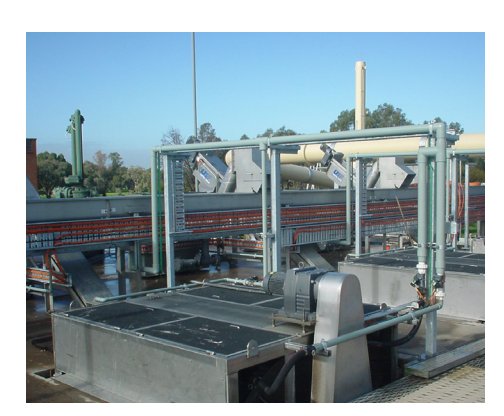
Multiple WS 175/175 Suboscreens

The data contained in this document is for information only and values are typical. Please contact Aqseptence Group for confirmation.