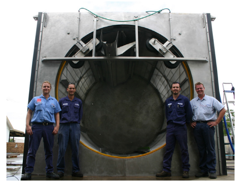
WS 300/300 Suboscreen for \alpha WS 120/120 Suboscreen desalination plant