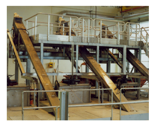
Solids are lifted out by lifting staves