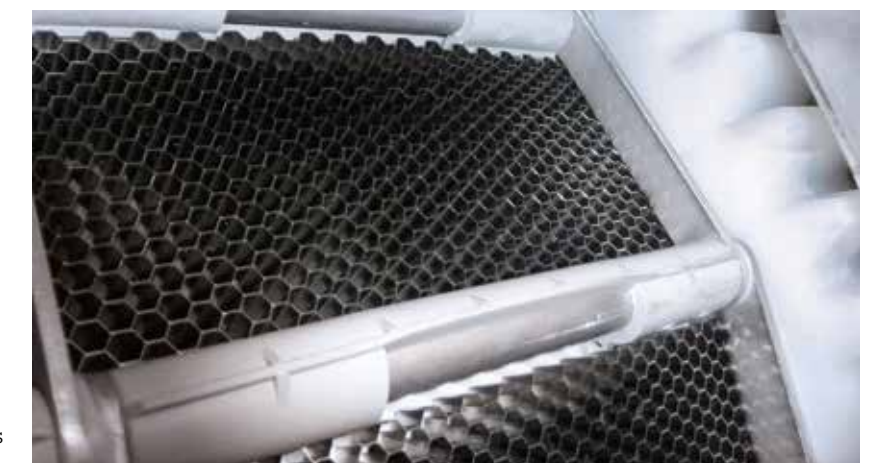
Sieve Belt from outside: honeycomb panel, hooks, guide links