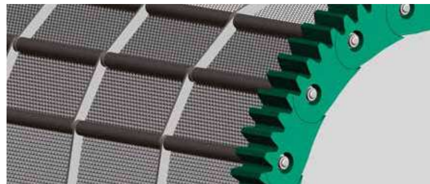
Illustrated band elements: panels and guide links

During the cleaning cycle, the band screen will rotate, lifting the collected solids and dropping them into the discharge flume. The finer solids captured on the screen panels are flushed off the screen using the wash sparge system located on the opposite side of the screen. The cleaning cycle will typically run through a complete revolution of the band screen, effectively cleaning the entire screen. During the cleaning cycle the upstream water level will continue to drop until the screen is completely cleaned and normal operating levels are reached.