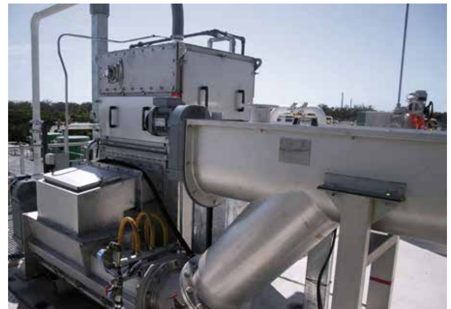
Centre-Flo directly discharging to Noggerath® Screening Wash Press NWP