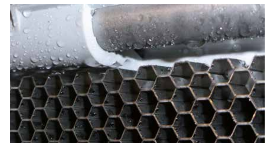
Fixing Filter Panel