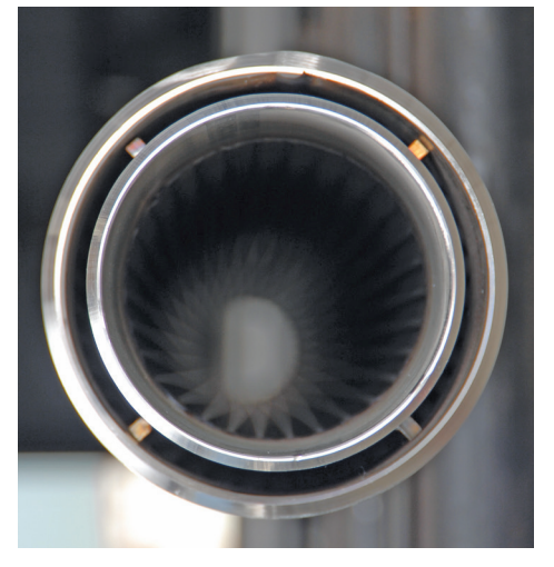
Packing process allows for a thinner filter pack