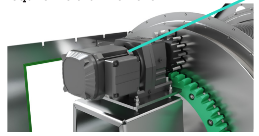
Direct drive with no chains and oilers.

Its self-cleaning, internally fed rotary fine screen relies on the shear force effect created by rotation of the drum to enhance the separation of solids from the effluent. Screened effluent passes through the Vee-Wire® slots into a tank from where it is pumped for further processing. Solids in the dewatering zone amalgamate and are continuously rolled on account of the rotation of the screen drum, resulting in further reduction of liquid content.